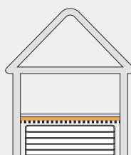
Garage with lined floor joist