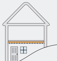
Workshop with lined floor joist